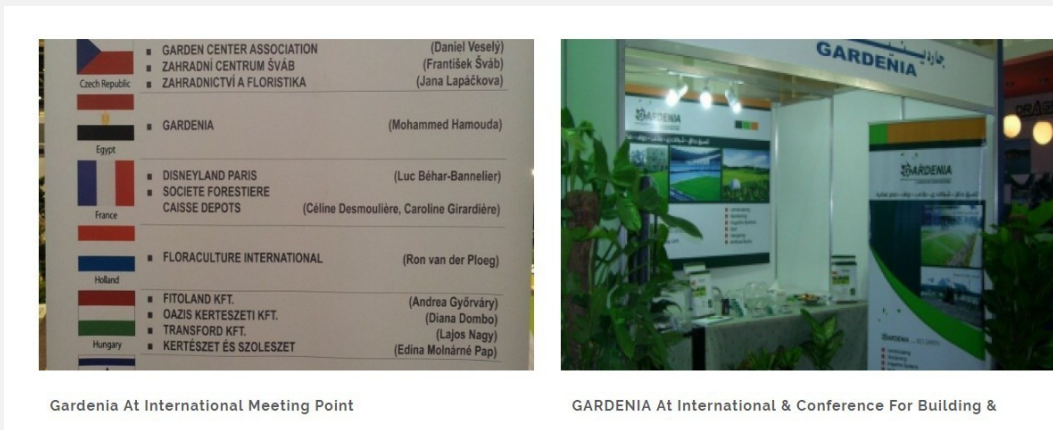
Gardenia At International Meeting Point

Images on most pages are stretched vertically and not cropped to fit the dimension of the placeholders. screenshot is an example. It's also notable on the projects page .